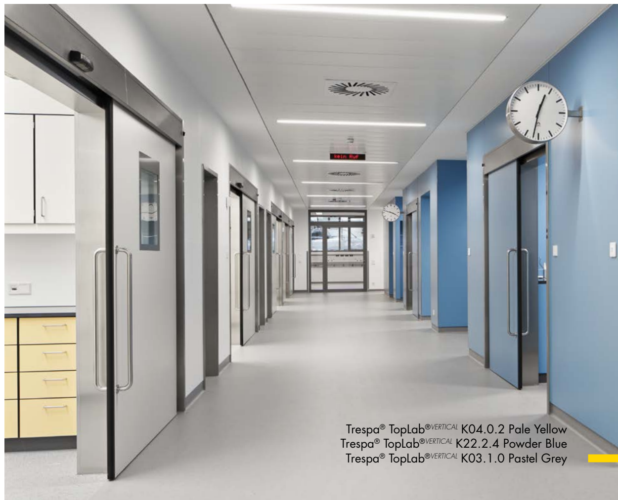
Trespa® TopLab® VERTICAL K04.0.2 Pale Yellow Trespa® TopLab® VERTICAL K22.2.4 Powder Blue Trespa® TopLab® VERTICAL K03.1.0 Pastel Grey

Electron Beam Curing, developed in-house by Trespa, represents a major contribution to innovation in the field of scientific surfaces. Using this fast, non-thermal curing method, Trespa® TopLab® VERTICAL decorative surfaces are hardened via high-energy electron emissions at a controlled rate. The resulting closed surface enables unique surface performance, in terms of resistance and colour stability: it encompasses a remarkable range of properties, to serve the needs of the most demanding professional environments.